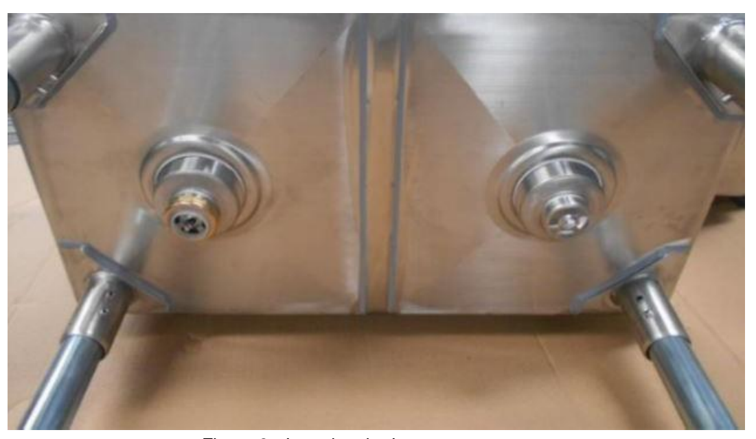
Figure 3 - Inserting the Legs

Step 4: Tighten the set screws using the hex key provided.