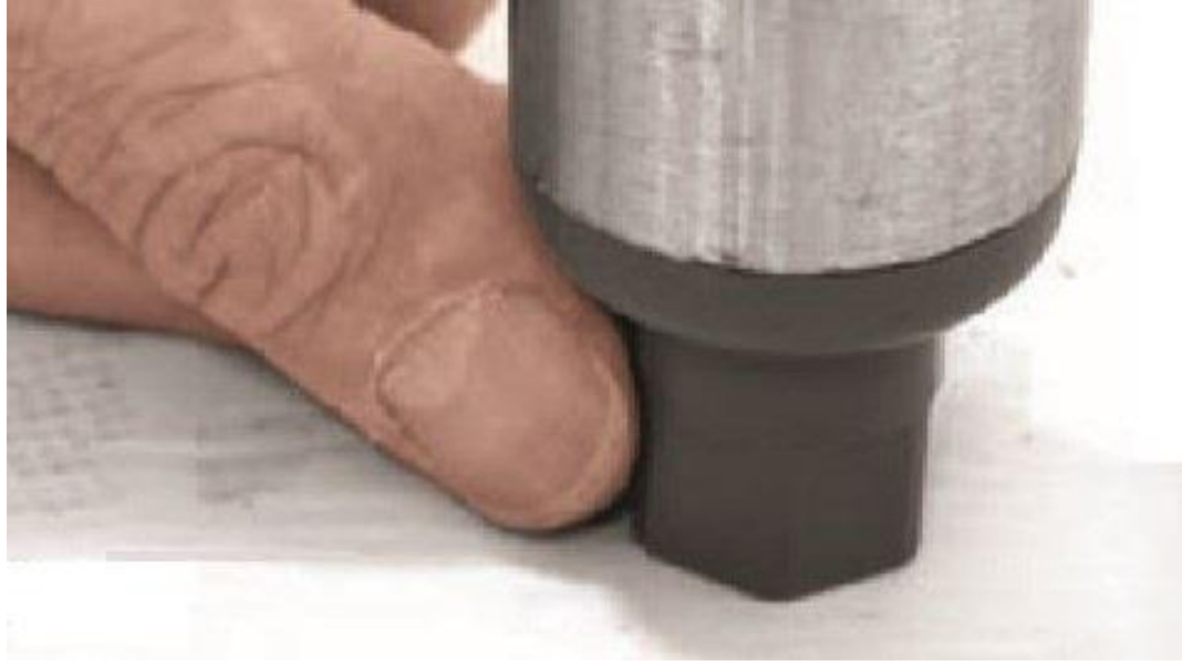
Figure 5 - Adjusting the Bullet Feet