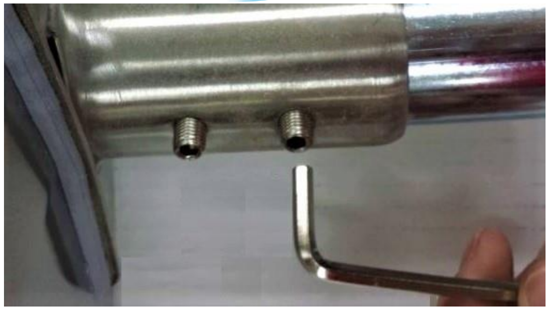
Figure 4 - Tightening the Set Screws

Step 5: Carefully turn the sink over onto its legs, placing it down on all four legs simultaneously to avoid stress on any individual leg.