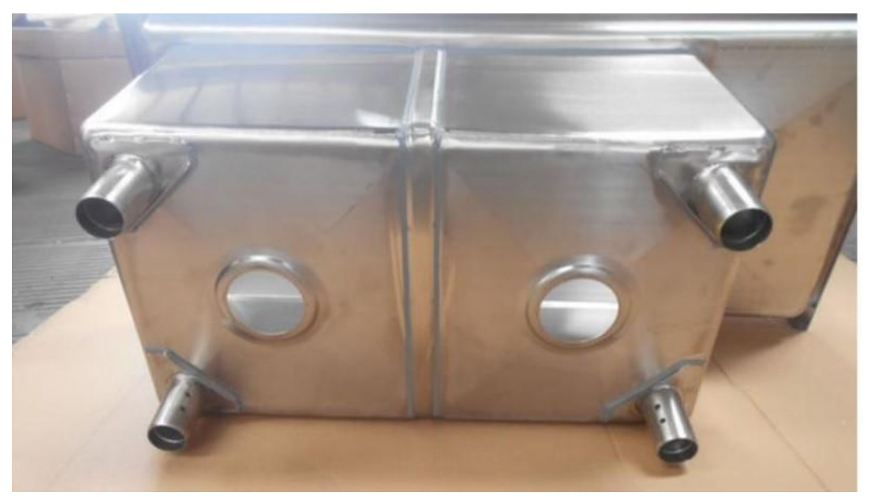
Figure 2 - Underside of Sink Unit

WARNING: THE SINK UNIT MAY BE HEAVY, TAKE PRECAUTIONS TO AVOID INJURY WHEN MOVING AND LIFTING THE SINK ASSEMBLY.